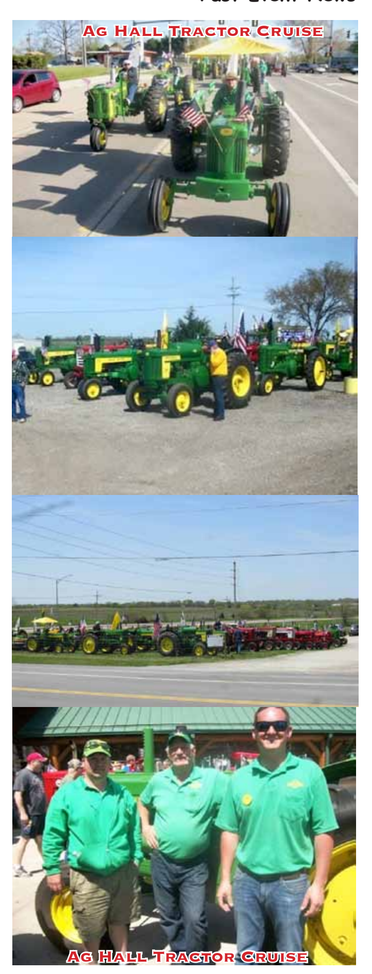
Page 4 of 8