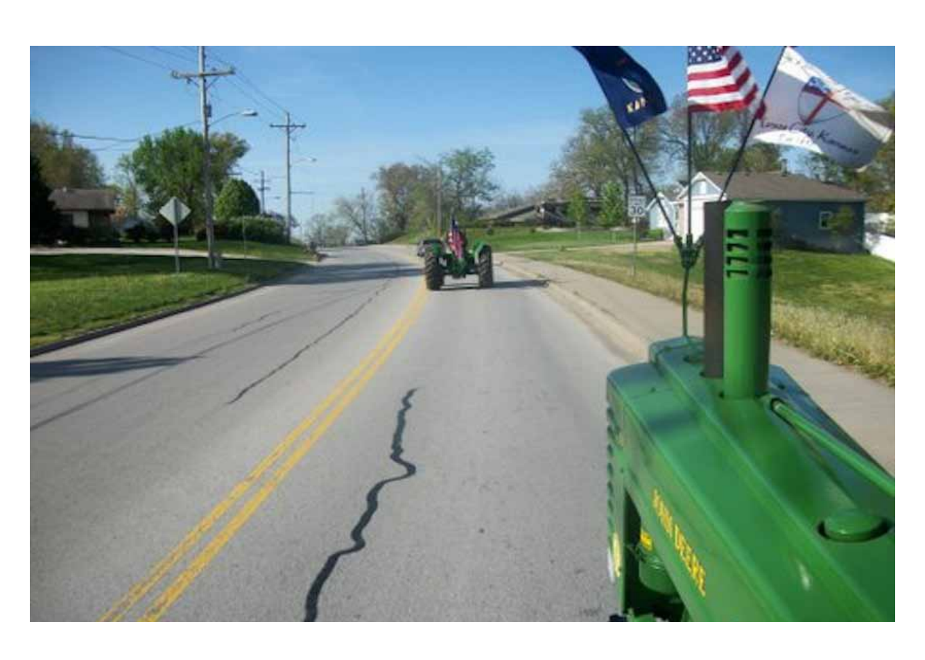
2014 AG HALL TRACTOR CRUISE