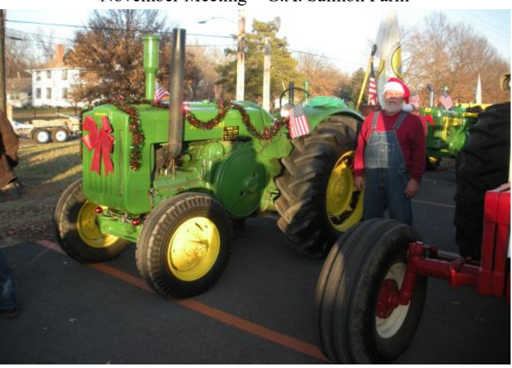
Oak Grove, MO—Christmas Parade