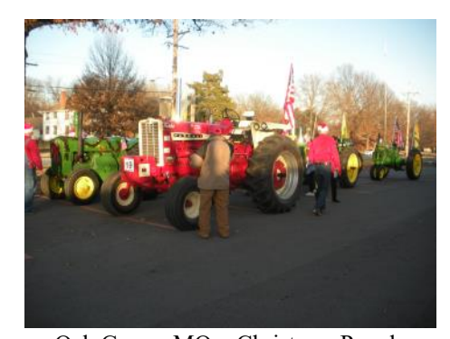
Oak Grove, MO—Christmas Parade