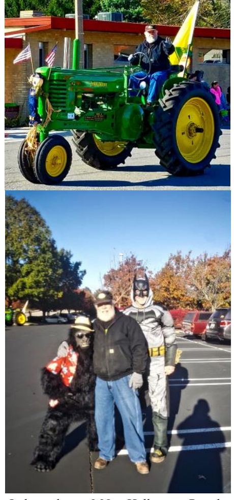
Independence, MO—Halloween Parade