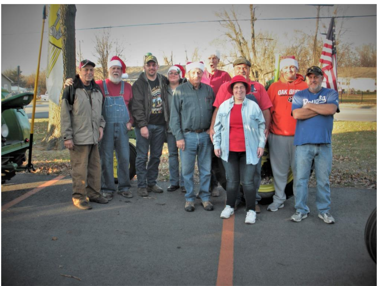
OAK GROVE CHRISTMAS PARADE 2017