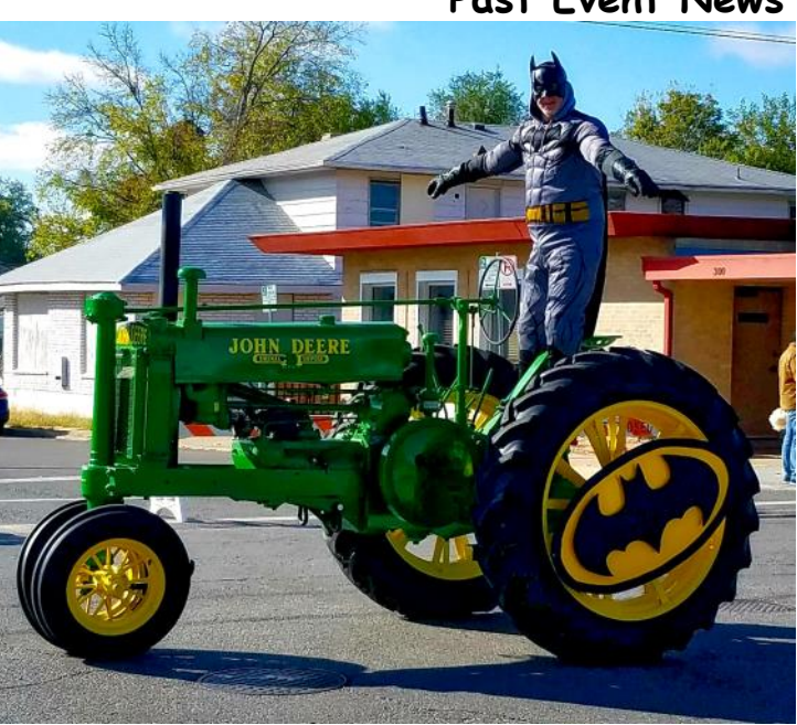
Independence, MO—Halloween Parade