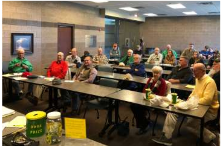
February Meeting—KCMO PD