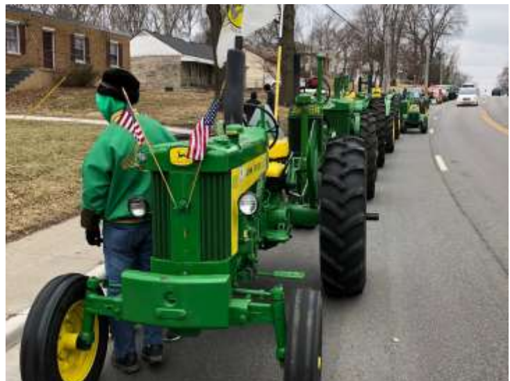
Shawnee St Patrick’s Day Parade