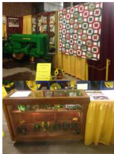
2018 Western Farm Show