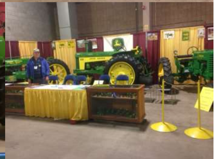
2018 Western Farm Show