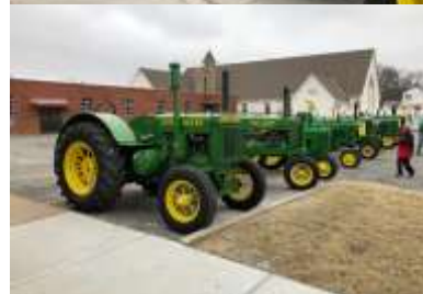
Shawnee, KS—St Pat's Day Parade