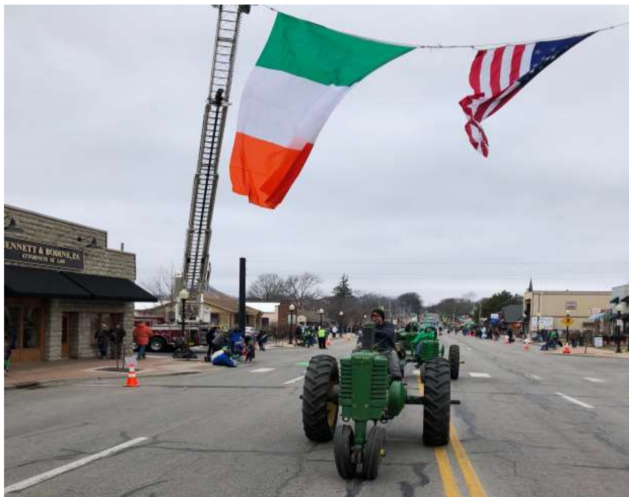
SHAWNEE ST PATRICK'S DAY PARADE 2018