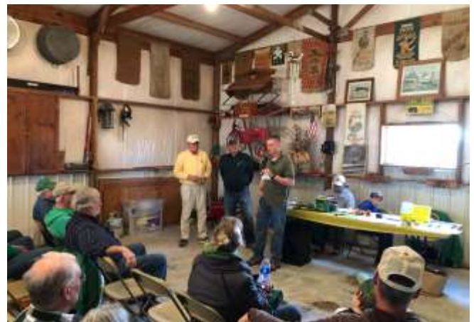
November GKCTCC Meeting