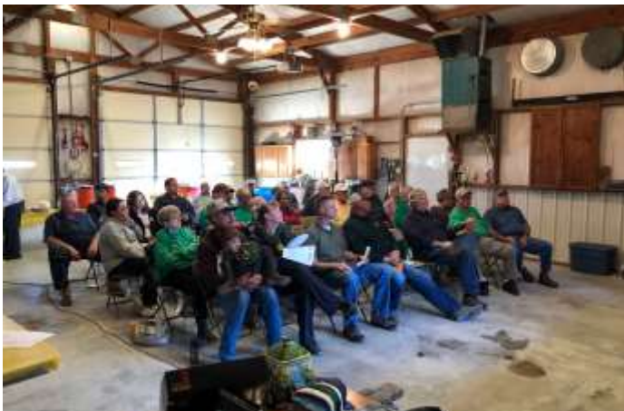
November GKCTCC Meeting