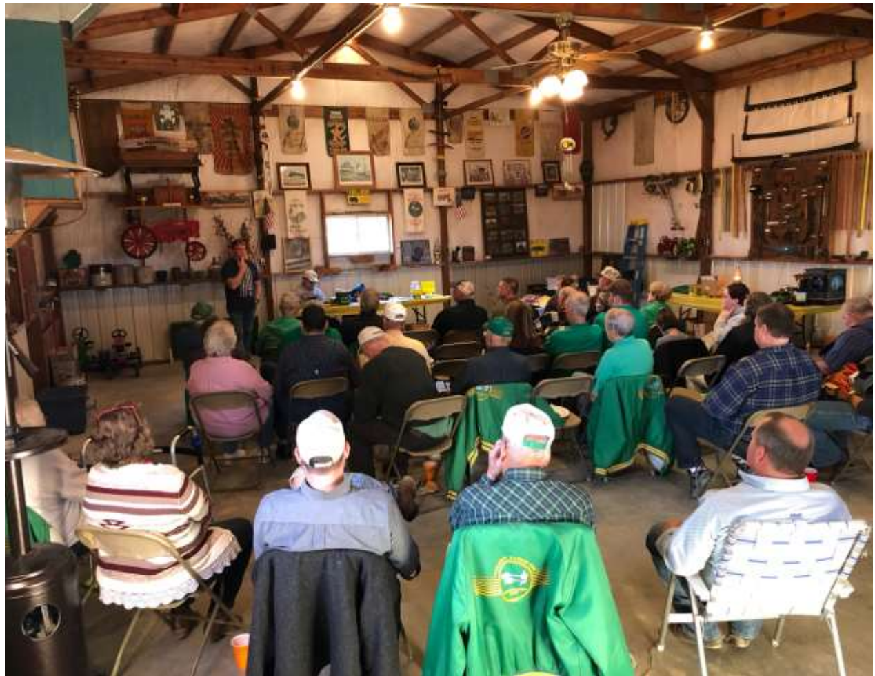
November Meeting and White Elephant Auction