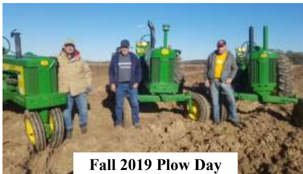
Fall 2019 Plow Day

Note: All dates are subject to change. Please check with a contact person to confirm date. GKCTCC Meetings and event changes are in Bold.