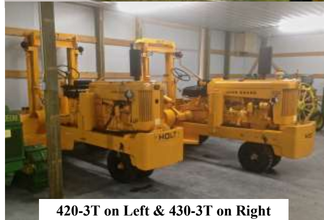
420-3T on Left & 430-3T on Right