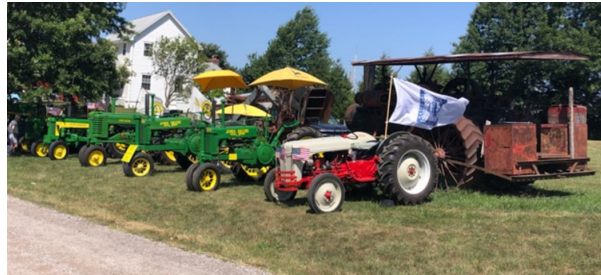
Ag Show and Shine Car, Truck and Tractor Daze Show—July 23, 2022