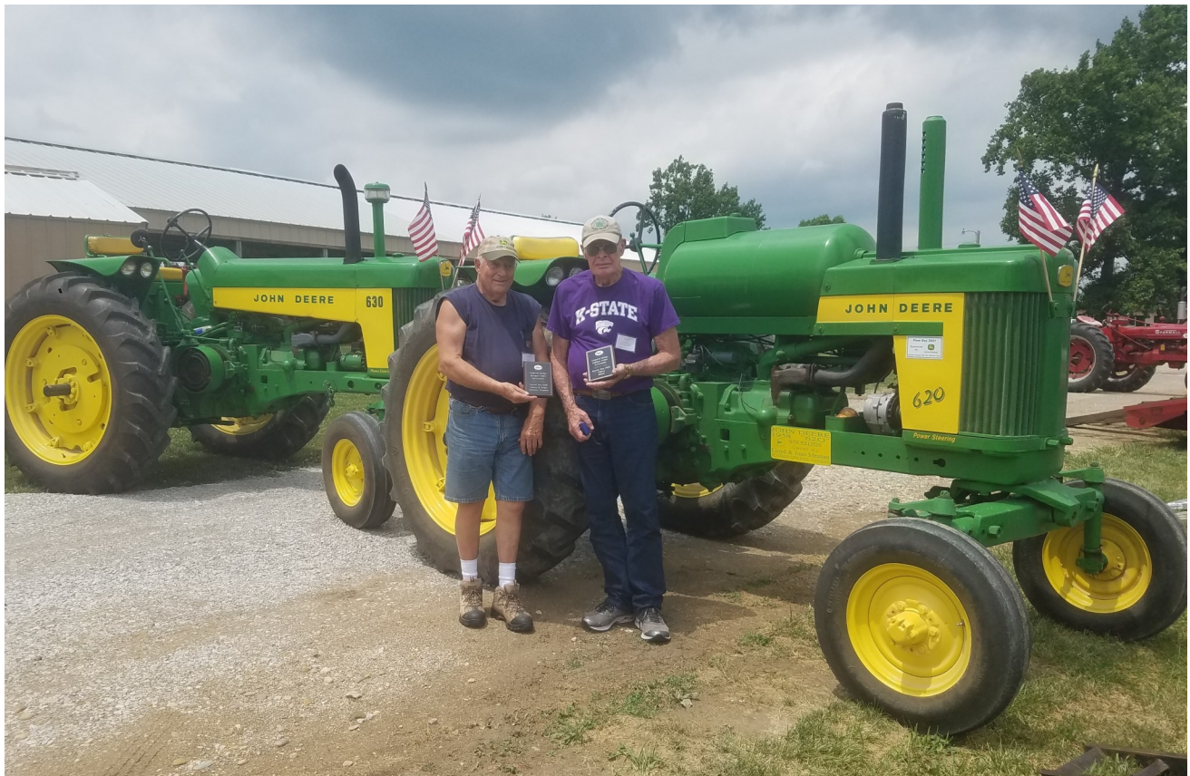
Covered Bridge Tractor Tour Rockville, Indiana June 24-25, 2022