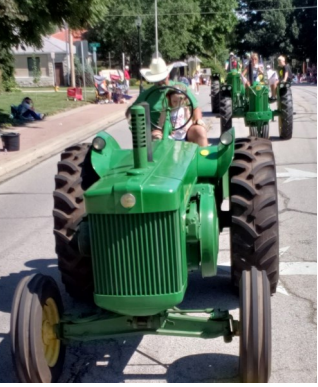
LEAVENWORTH COUNTY FAIR PARADE was held on July 25th in Tonganoxie. We had a nice turn-out on a warm summer's evening. Thank you to all our tractor club friends who participated! We received 1st place in the Tonganoxie parade in the antique division!