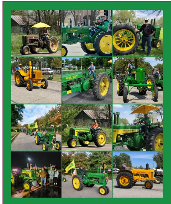
Image is the blanket that will be up for auction at the June meeting.