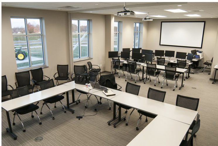
Adrian Heritage Conference Room

The year is winding down, and we only have a few more activities on the calendar for this year. It has been a pleasure to lead the Club and we need to start planning for 2025. We encourage you to talk with the officers about ideas you have or ways you can help out with events/tasks. We are always looking for places to host our upcoming meetings, so if you have any ideas please let a board member know. Maybe we can come to your place and admire your collection.