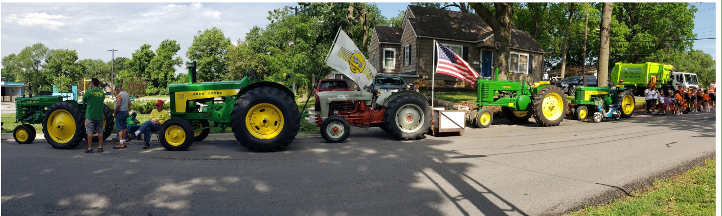
OLD SHAWNEE DAYS PARADE LINE-UP